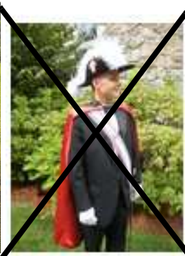
OUT Current Regalia