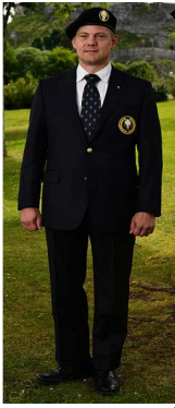
IN New Regalia