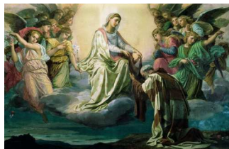
Blessed Mother giving the scapular to Simon Stock .

“Receive, my beloved son, this habit of thy order...whosoever dies clothed in this shall never suffer eternal fire.”