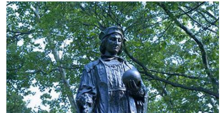
Statue of Christopher Columbus

Simply go to www.stmatthiascofc.com/dues.html .